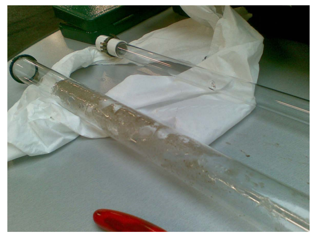
After 3 hours of US: reduction of the biofilm